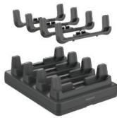
EDA10A-CB-0 EDA10A-CB-1 EDA10A-CB-2 EDA10A-CB-3 EDA10A-CB-5

EDA10A four (4) battery packs (EDA10A-BAT). Kit includes: charging base, power supply and power cord (-1 for U.S., -2 for Europe, -3 for UK, and -5 for AU).