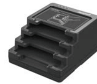
EDA10A-QBC-1 EDA10A-QBC-2 EDA10A-QBC-3 EDA10A-QBC-5

Ports: 3x USB-A, 1xHDMI, 1x RJ45 Ethernet.