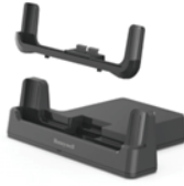
EDA10A-DB-0 EDA10A-DB-1 EDA10A-DB-2 EDA10A-DB-3 EDA10A-DB-5

Single charging dock for EDA10A with or without protective boot, compatible with hand strap. Kit includes: dock, convertible adapter cup (EDA10A-ADC), USB charging cable, 5V 2A power adapter, and plugs for US, UK, AU, EU, IN.